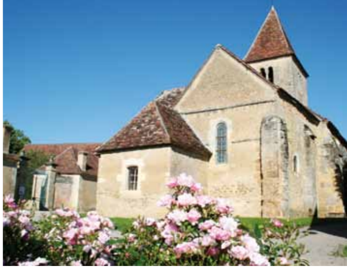
Church of Saint Anne in Nohant

«if you come round, bon voyage! if you stay, good for you!» George Sand